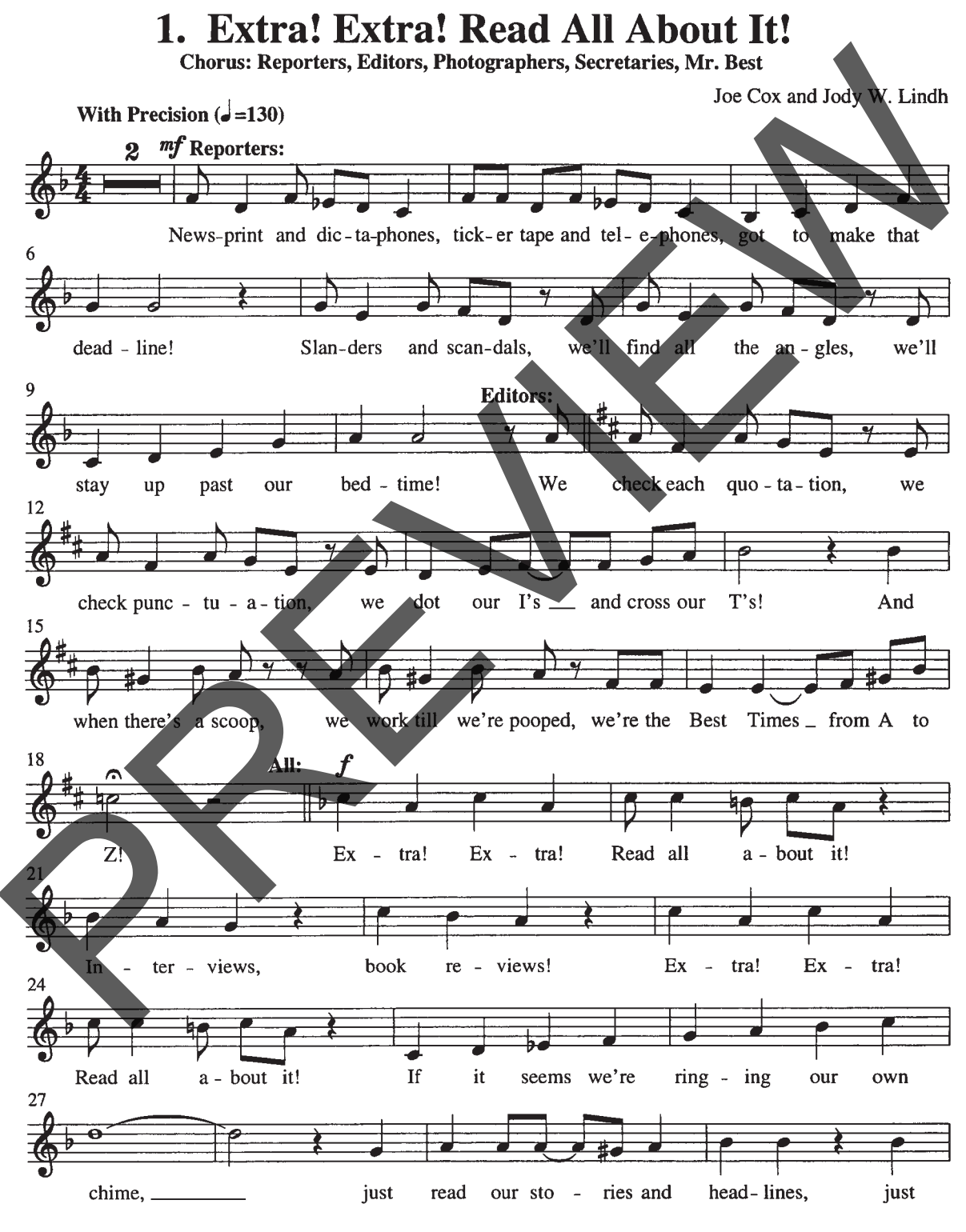
Copyright © 1995 Choristers Guild. All rights reserved. Printed in U.S.A. Reproduction in any portion or form is prohibited without publisher's permission.

As music for Song 1 begins, the lights come up on a busy newsroom of a large metropolitan newspaper. Set background: city skyscrapers. Optional SFX: press room typing, teletype, presses running, phones ringing. If desired, each group (reporters, editors, photographers) may enter just prior to their vocal entrance.