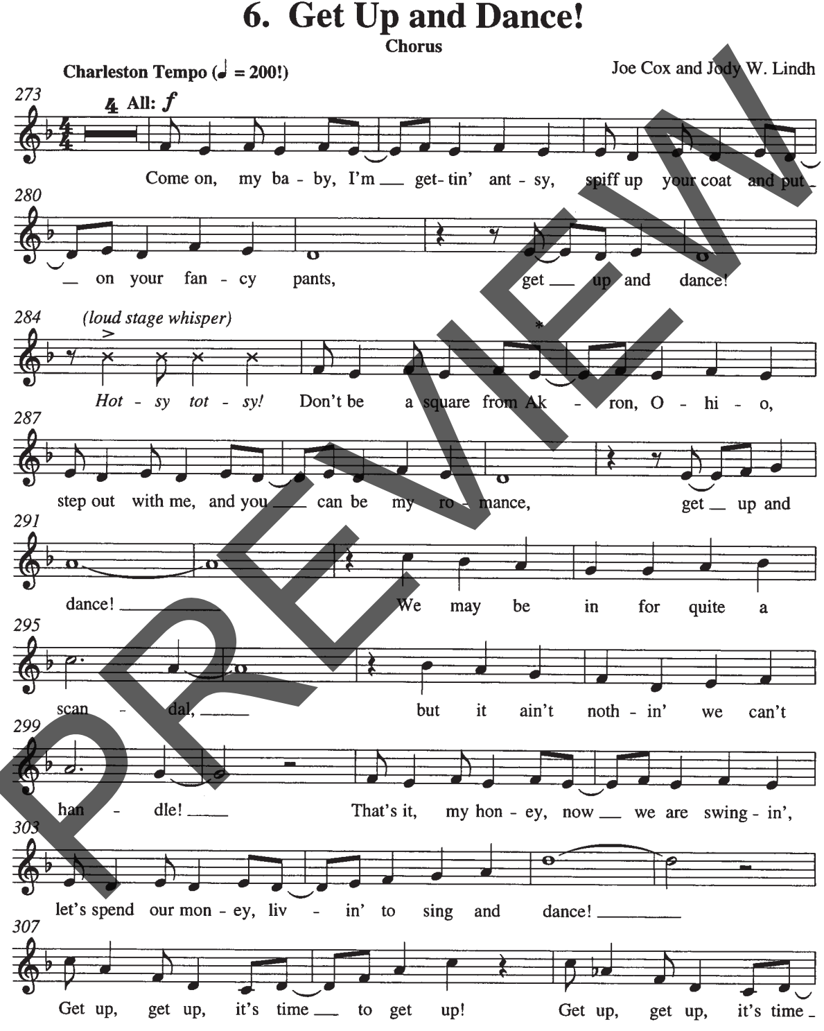
* Residents of Akron, Ohio: if desired, choose another 2-syllable city in Ohio! Ohio must be used to retain the rhyme scheme: "Ohio" / "my ro" - (mance).

At the beginning of the song, the cast hurries onto stage to begin the song and dance (Charleston). If more time is needed to get cast members on stage, the piano introduction may be extended by using the accompaniment from measures 35-40 which may be played prior to measure 1. At the end of the song, the applause is interrupted by the sudden entry of the Newspaper Kid.