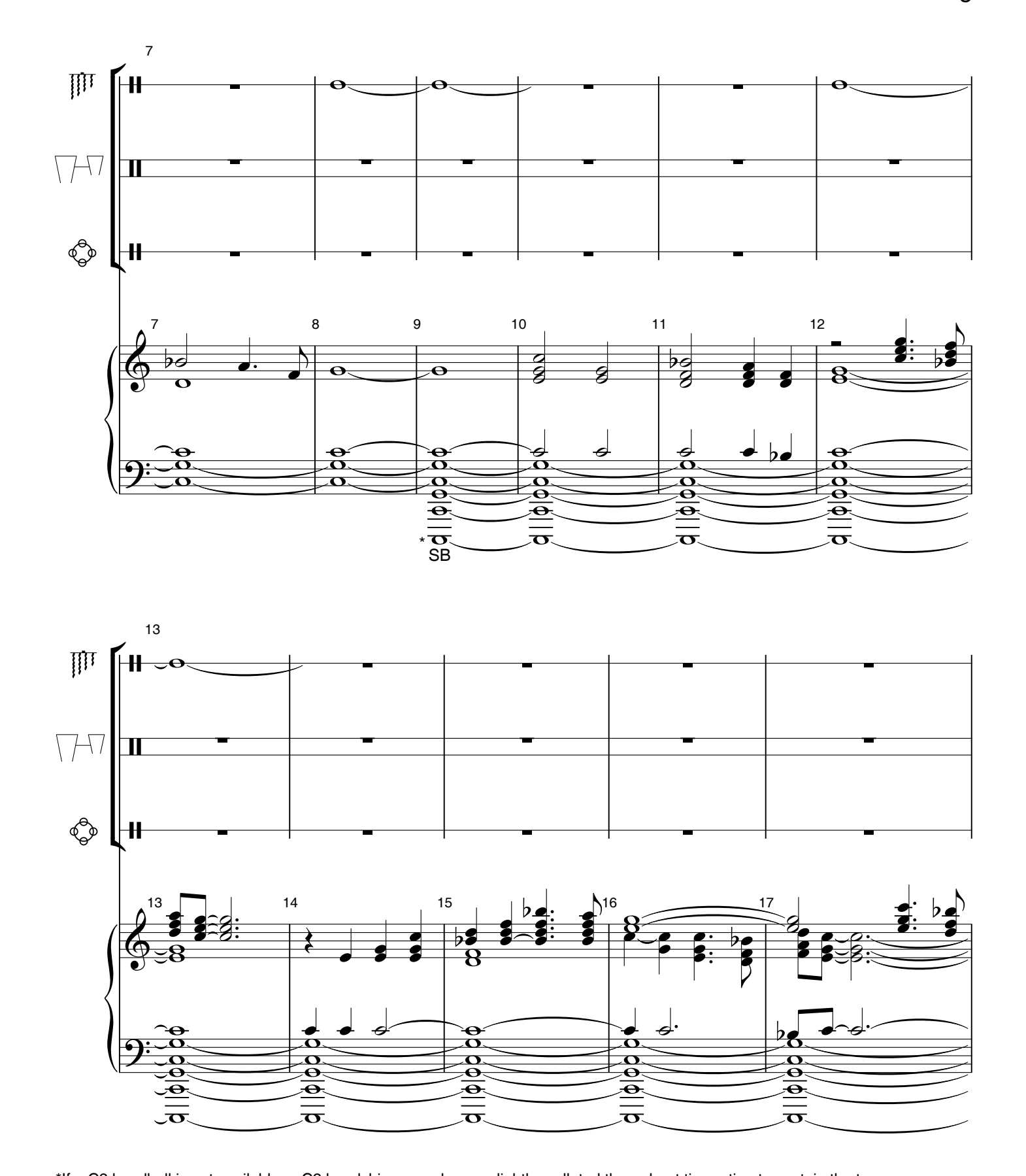
^{\star} If a C2 handbell is not available, a C2 handchime may be very lightly malleted throughout tis section to sustain the tone.