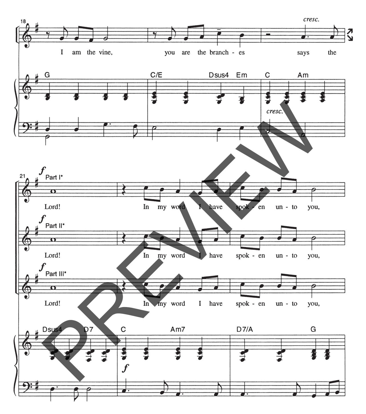
*For Unison, sing Part I; for 2 part voicing, sing Parts I and II (boys sing part I); for 3 part voicing, boys sing Part I, treble voices sing Parts II and III.