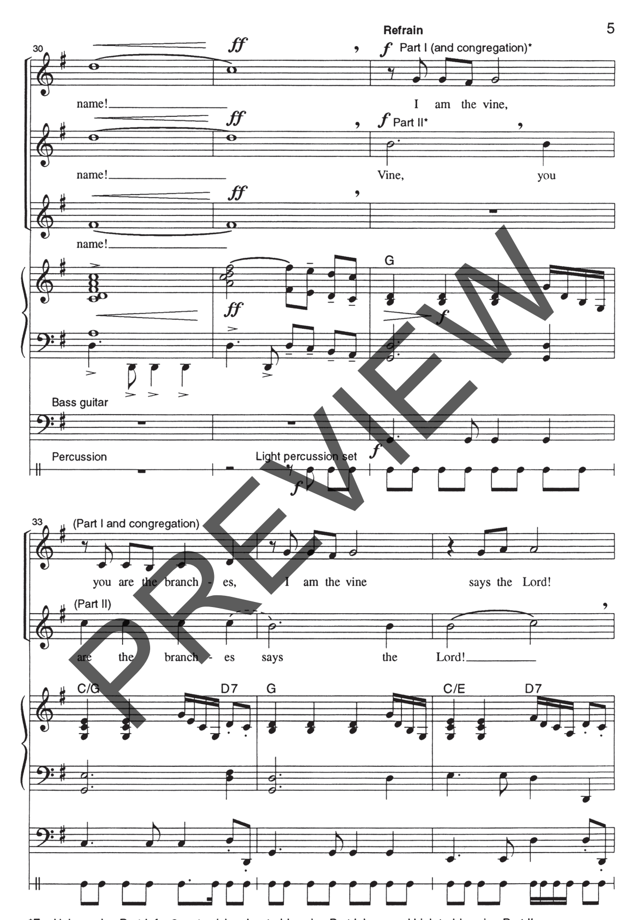
*For Unison, sing Part I; for 2 part voicing, low trebles sing Part I, boys and high trebles sing Part II.