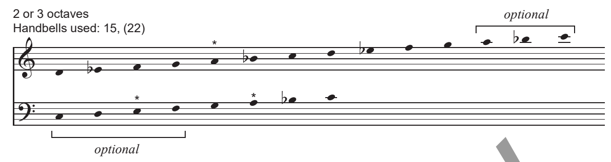
*E4, A4, and A5 used only in optional measures 5-8.

ST. THEODULPH Melchior Teschner, 1584-1635 arr. Cathy Moklebust (ASCAP)