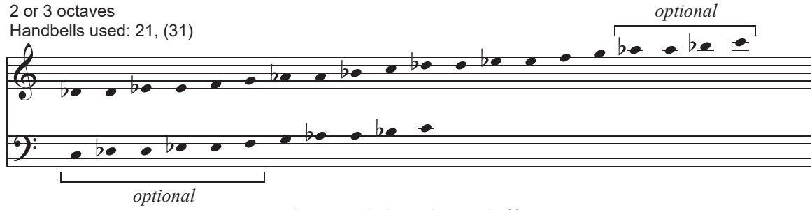
2 octave choirs omit notes in ().