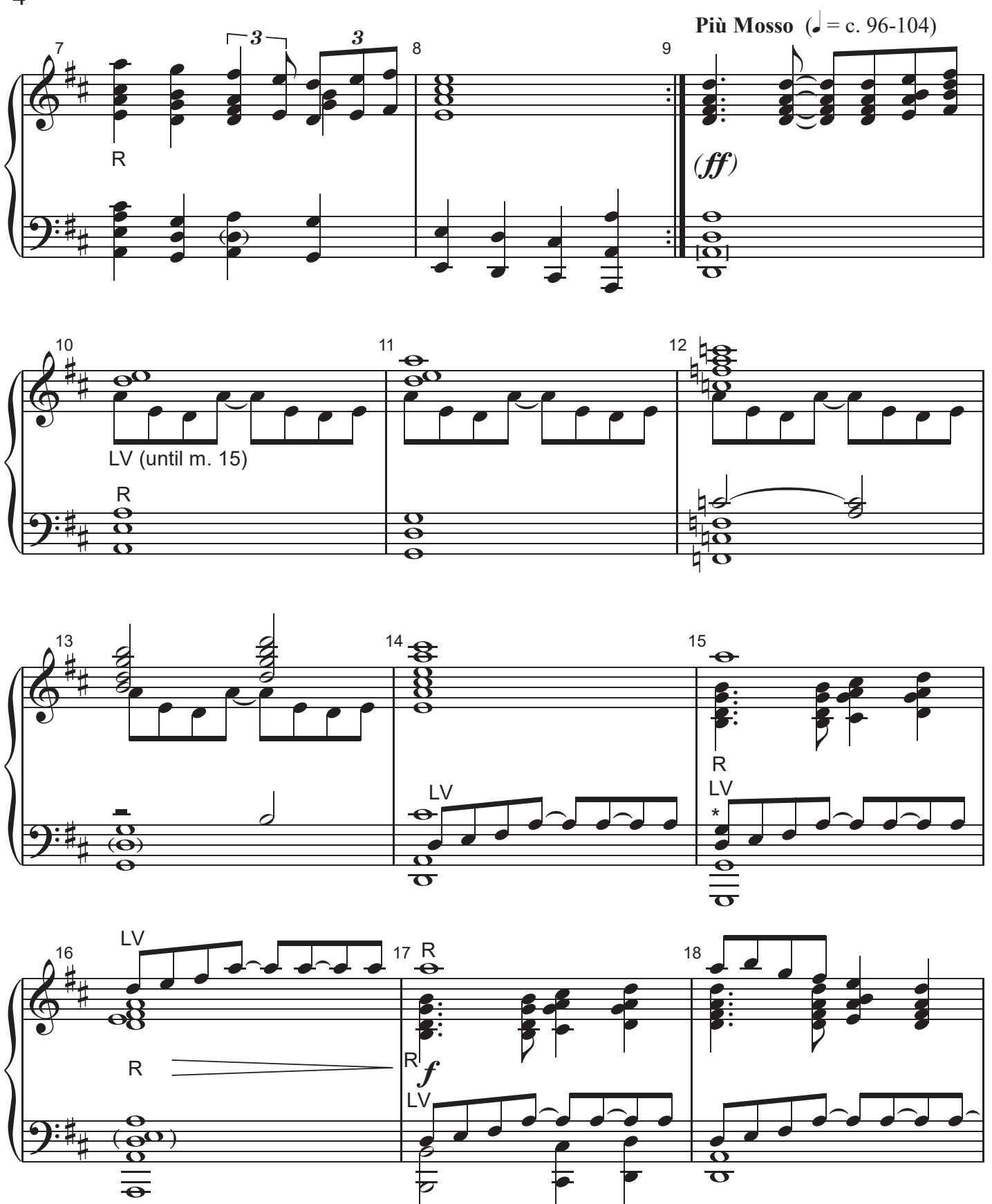
*For clarity and legibility, B4/C#5 are notated in treble clef in mm. 15-17.