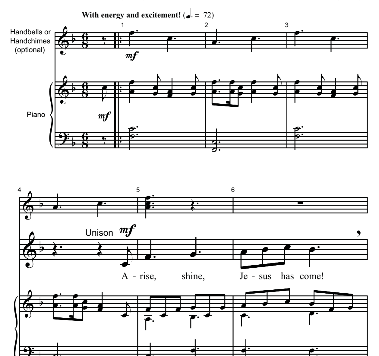
Copyright © 2004 Choristers Guild. All rights reserved. Printed in U.S.A. Reproduction of all or any portion in any form is prohibited without permission of the publisher.

The CCLI license does not grant permission to photocopy this music.